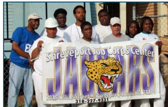
Shreveport Job Corps Center Painting students displaying the center's banner at the restoration project site in Shreveport's Allendale community.

The project is part of a historic preservation and revitalization initiative sponsored by The Fuller Center for Housing of Northwest, Louisiana, a Shreveport Job Corps Center Work-Based Learning partner.