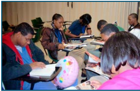
Students at Dr. Benjamin L. Hooks Job Corps Center reading during Stop, Drop, and Read.

Visit Dr. Benjamin L. Hooks Job Corps Center any weekday between 10:15 a.m. and 10:40 a.m., and you will find students and staff with a book or magazine in-hand and reading.