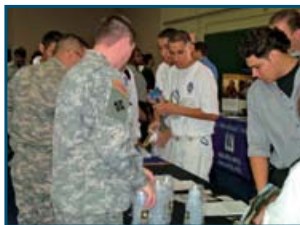
Military Recruiters answering Phoenix Job Corps Center student's questions.

An Education and Military Fair sponsored by Phoenix JCC featured recruiters from 11 educational institutions and five branches of the military. The event provided