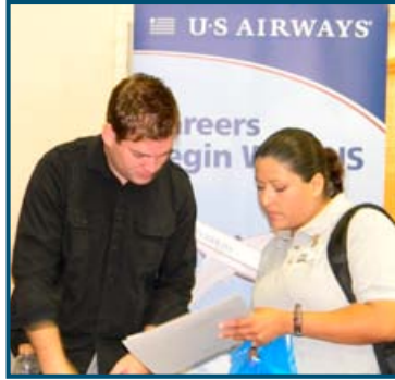
A Phoenix Job Corps Center student speaking with a U.S. Airways Recruiter

Phoenix Job Corps Center staff is actively helping its students bolster their knowledge of the job market and gain experience interfacing with business, education and military recruiters by hosting job fairs. The events are well-attended and open to the public during specific times. Local media provides coverage, which has increased the center's visibility in the community.