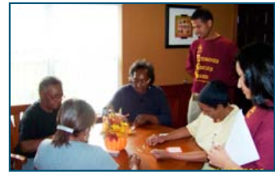
St. Louis Job Corps Center students helping residents with a game of bingo.

The SGA students now recognize that when they share their vitality and youthful exuberance in a game of BINGO with the Stratford residents, they gain a wealth of knowl-